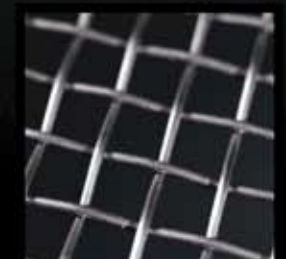
Woven Wire Mesh